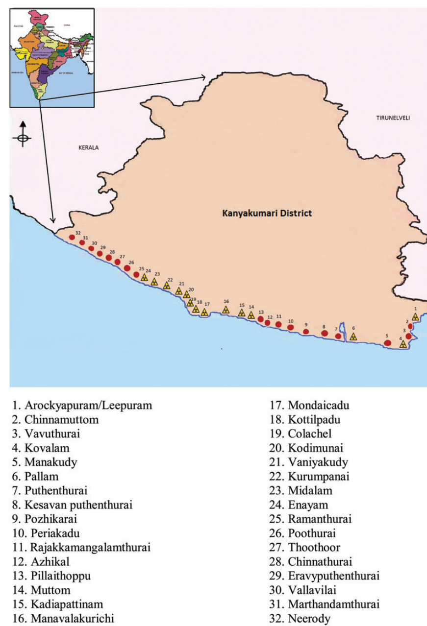
Downloaded from http://rpd.oxfordjournals.org/ at University of Western Ontario on March 8, 2015